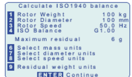
ISO 1940 Calculator