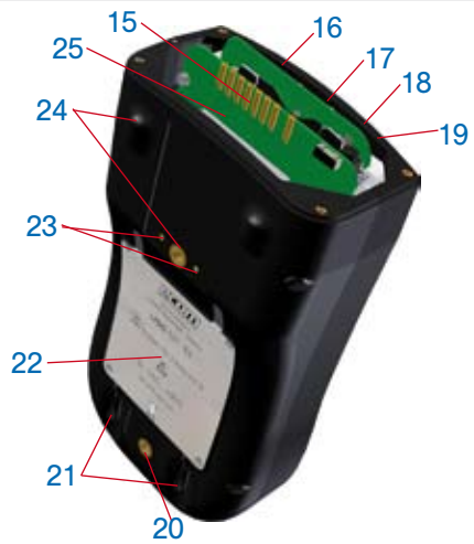
back and inhousing components*