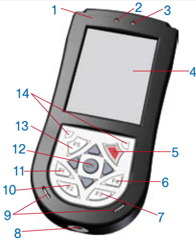
Front and bottom panel components