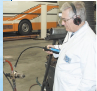
Compressed air in a workshop

To verify the tightness of any volume (vehicles, aircraft, clean rooms, building envelope, nuclear containment walls, etc...) you need the reliability and precision of the ultrasonic testing method. Ultrasonic leak testing is the most widely-used method for identifying wind noise and water leaks in vehicles, and integrity issues in other closed volumes.