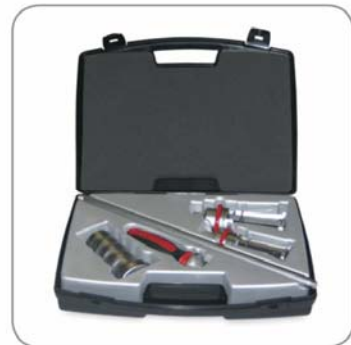
TMIP 30-60 Supplied with 2 extractors covering bore diameters from 30 to 60 mm (1,2 to 2,4 in)