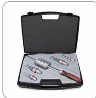
TMIP 7-28 Supplied with 4 extractors covering bore diameters from 7 to 28 mm (0,28 to 1,1 in)