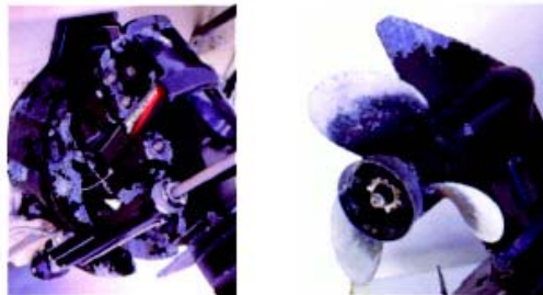
Typical signs of corrosion on marine lower drive units and propellers include blistering paint and the formation of a white powdery substance on the exposed metal areas

The first sign of galvanic corrosion is paint blistering (starting on sharp edges) below the water line—a white powdery substance forms on the exposed metal areas. As the corrosion continues, the exposed metal areas will become deeply pitted, as the metal is actually eaten away.