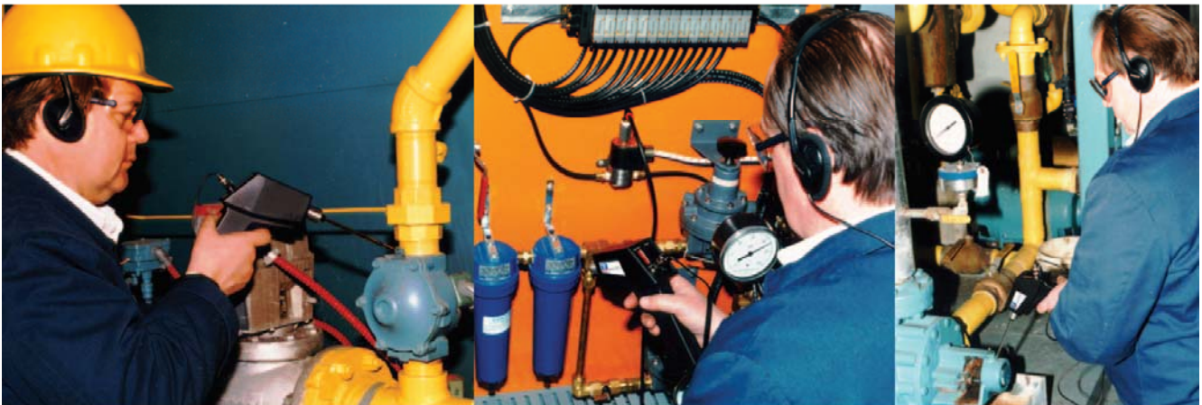
Left to right: Valve Leakage, Pressure / Vacuum Leaks, Mechanical Inspection and Tank Leakage.

General mechanical inspection of pumps, motors, compressors, gears and gear boxes: All types of operating equipment may be inspected with the Inspector 400. Since