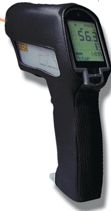
Temperatures acquired without contact.

For non-contact temperature measurement and monitoring of temperature processes in hazardous areas.